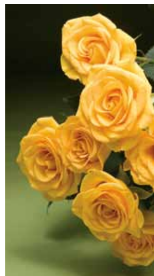
Equiflor Yellow Babe