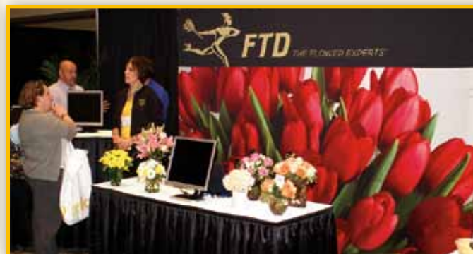
The FTD booth showcased its latest spring containers and its FTD POS System.