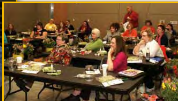
Hands-On and Business Sessions offered everything from Web tips to designing tricks.