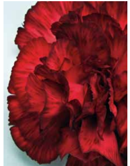
Equiflor Red Fan

rose farms are quite small; but we believe that the care and attention to quality is superior.”