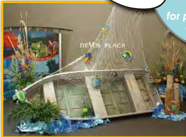
A creative representation of the Expo's Navigation theme.