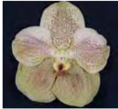
Van's Vanda Orchids