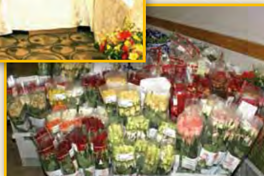
Thousands of fresh flowers were donated to use at the Expo. Thank you to the growers and wholesalers who donated the products!