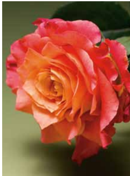
Equiflor Free Spirit