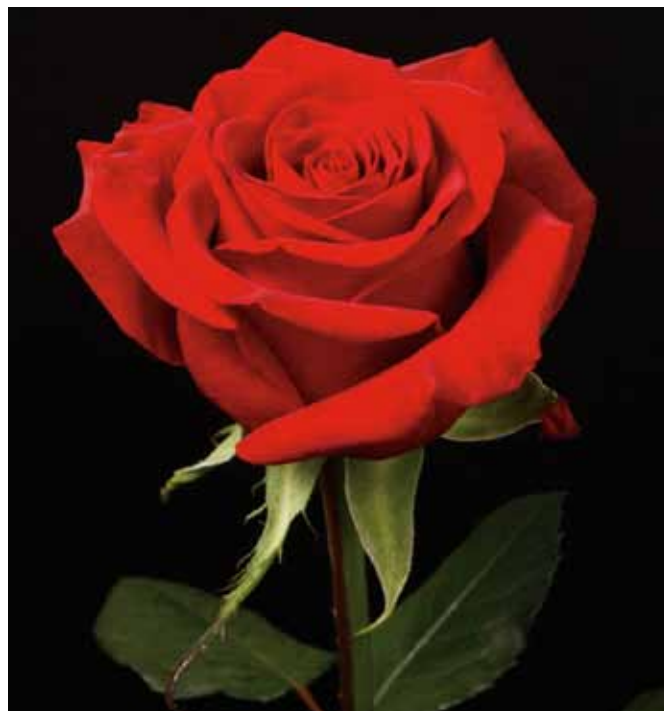
Esmeralda Farms Red Bentley

Floral wholesalers can provide you with the very latest in rose varieties. Esmeralda Farms, who directly owns their farms, has developed an exquisite new rose called 'Red Bentley.' This Esmeralda exclusive variety has vibrant red, velvety petals; long, strong stems; clean foliage and a very good vase life.