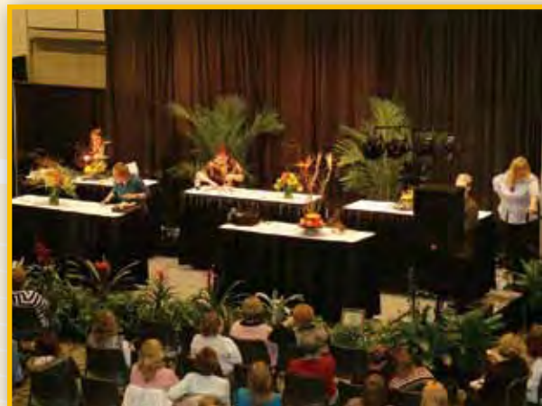
The 2010 Designer of the Year runoff, the "Iron Chef" of floral competitions.