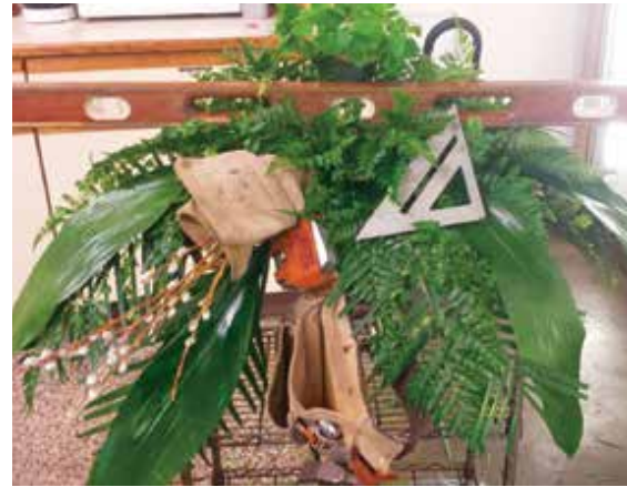
Arrangement for a contractor