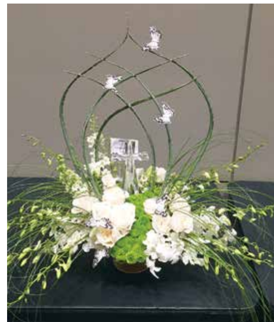
Arrangement by Gerald Toh

Clear tape and wooden picks may work for you or maybe some flexible aluminum wire. I have learned that plastic zip ties hold many materials better than wires. Two hard materials that are wired together will often wiggle and slide around, but zip ties eliminate this problem; they really hold items snugly.