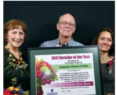
Retailer of the Year Kennedy's Flowers & Gifts Grand Rapids, MI