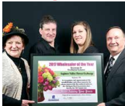
Wholesaler of the Year Saginaw Valley Flower Exchange Saginaw, MI