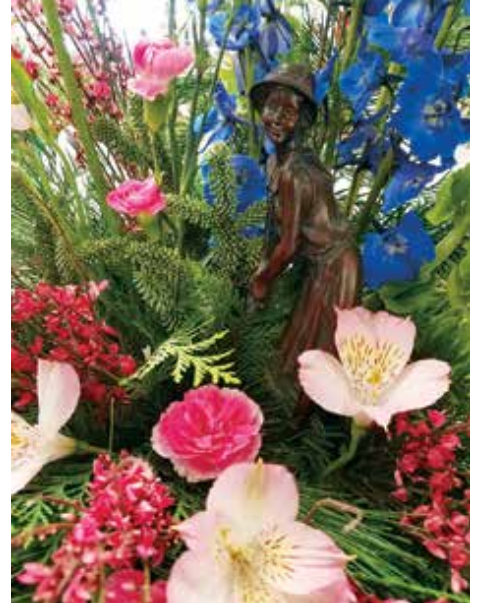
Arrangement for golfer

Using fresh, superior product will always mean repeat business from your customer and assures that some new customers will be using your flower shop next time. Wouldn't it be nice as a sender to hear the family took home your vase arrangement and it lasted three weeks after the service and was beautiful. If faced with a situation where the flower arrangement does require freshening or replacement due to wilting or damaged flowers be expeditious in dealing with the situation; act immediately.