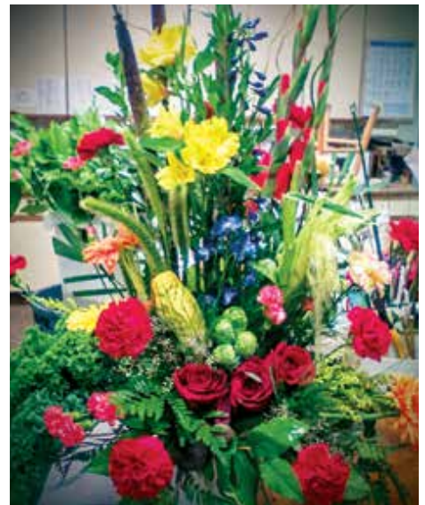
Design for produce seller

The second important point is good mechanics. Make sure your pieces are put together to stay together. The last thing you want is to have a furious director frantically calling you to complain about the statuary that fell out of your arrangement. Never leave sharp ends exposed. You don't want a call or find out after the fact your funeral director cut themselves on one of your pieces while