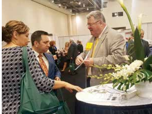
Talking about the issues with MFDA convention attendees. (Thank you to Eastern Floral for providing the beautiful sympathy designs for the booth.)

Every attendee I spoke with said they appreciate and understand the important role flowers play in the service. The national survey